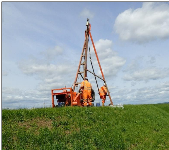
Borehole drilling on South Ferriby's flood embankments

drill boreholes in the flood embankment to take soil samples to understand the ground conditions. The locations of the boreholes have been chosen by using the results from geophysical survey work last summer. Using these results has allowed us to pinpoint what parts of the insides of flood banks we are particularly interested to know more about. Please see picture below.