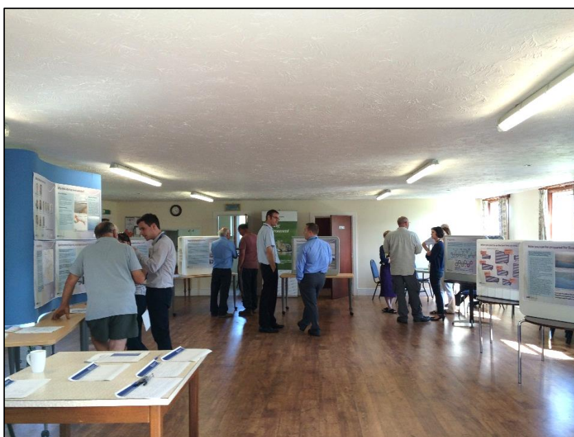
Skeffling community event: local people talking to Environment Agency staff

We held a community drop-in in July to speak to local people about a habitat creation project. The Welwick to Skeffling Management Realignment Scheme will create important habitat to replace ongoing losses and provides an opportunity to reduce flood risk to land and communities. The event was successful with local people attending to voice their concerns, speak to experts and understand the scheme better.