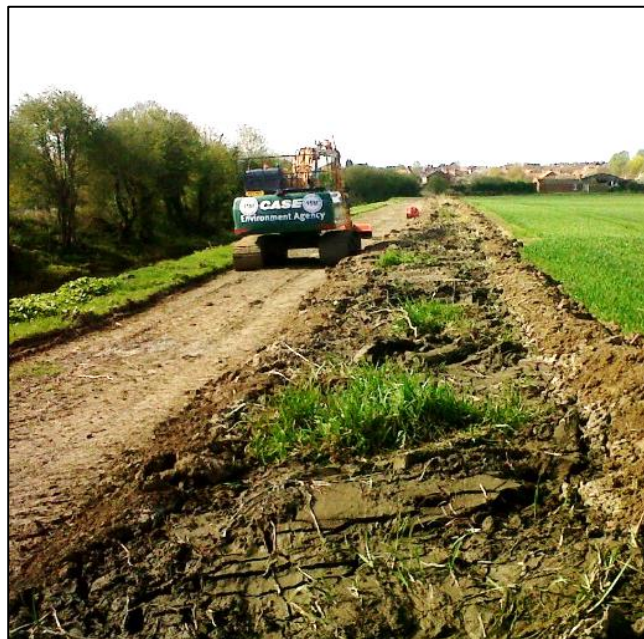
Winterton Beck: Left photo shows trench dug ready for the silt/right photo shows the trench full with silt